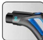
Other charging equipment